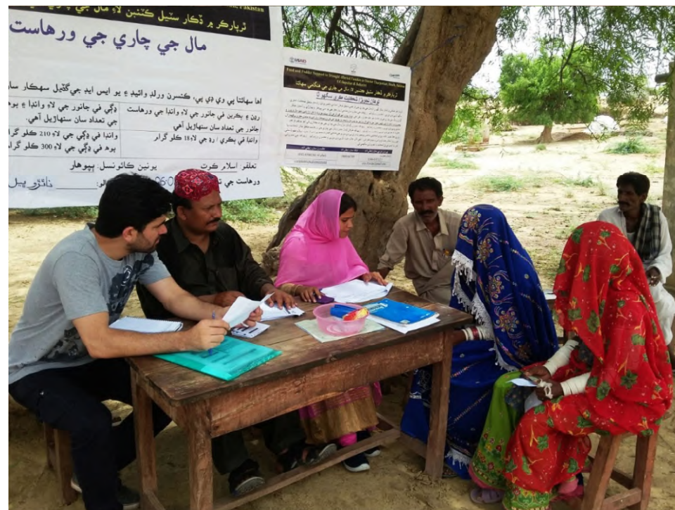
Livestock emergency relief of feed and fodder

17,863 people were engaged in livestock vaccination, staff capacity building, awareness raising, tree plantation activities