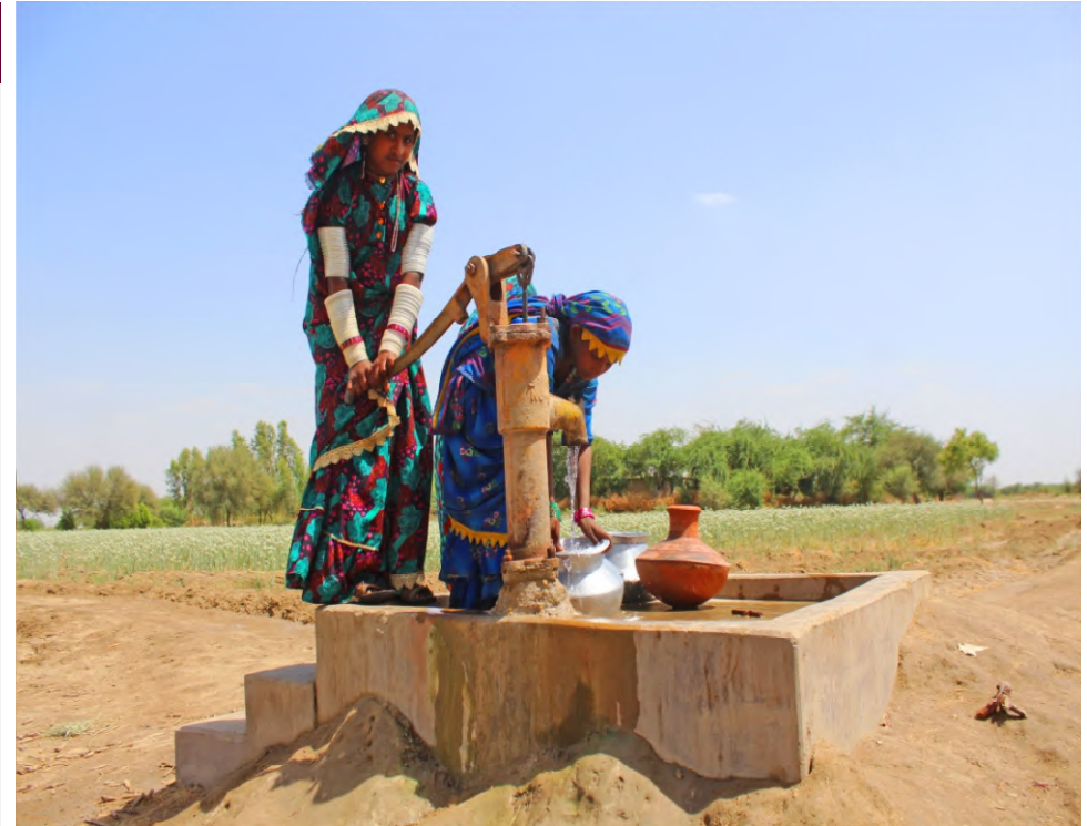
Improved access to water

People were engaged for improving quality of drinking water and sanitation facilities and awareness raising on Hygiene practices through theatre performances.