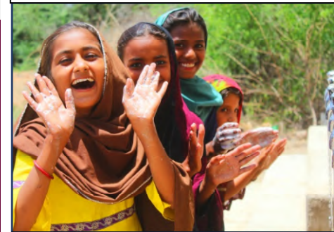
Improved hand washing practices