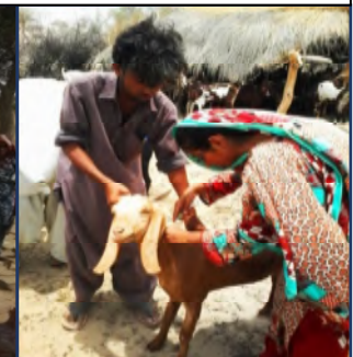
Vaccination of Livestock