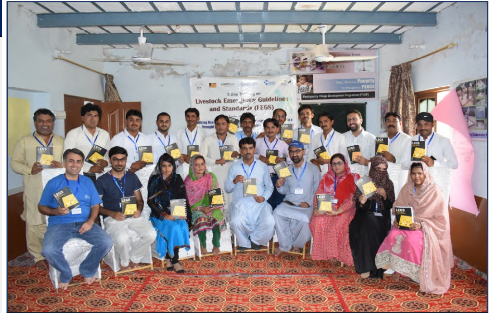
Training of PVDP Staff on Livestock Emergency Guidelines and Standards (LEGS)

123,400 people are engage in cash for work, capacity building events and awareness raising activities