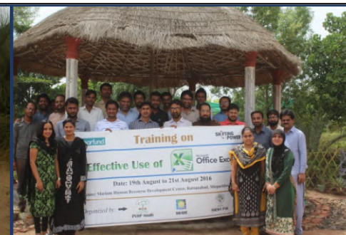
Enhancing capacity of staff on disaster preparedness