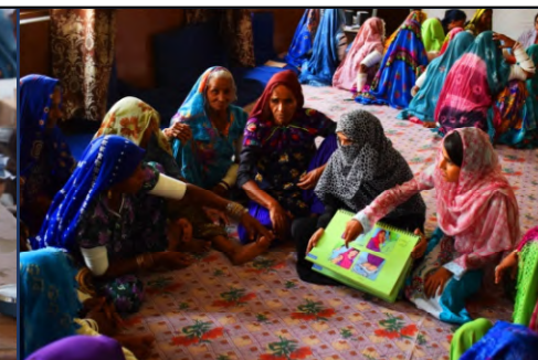
Health and Hygiene session for women