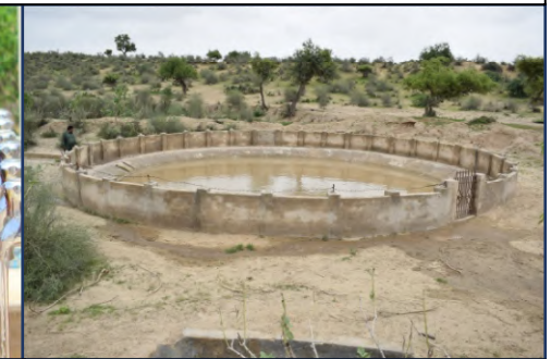
Rain water harvesting pond