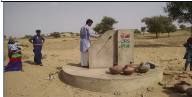
The Cash for Work Scheme of Repair well