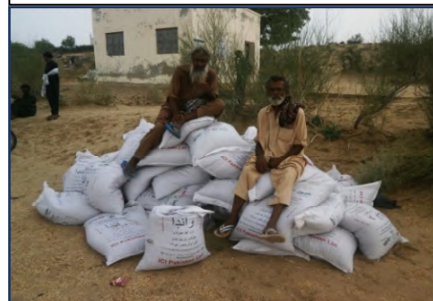
Feed and fodder support of drought affected families