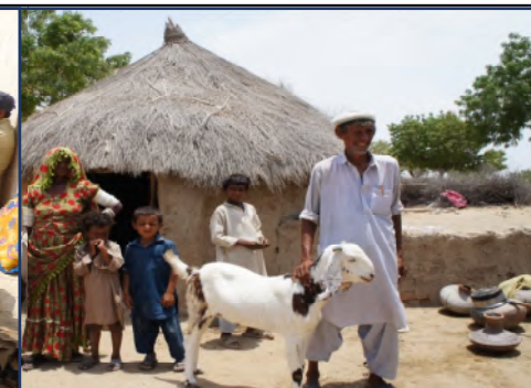
Capacity building on Livestock Management