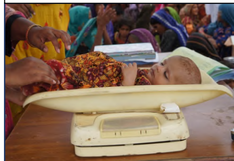
Health check-up of under 5 children