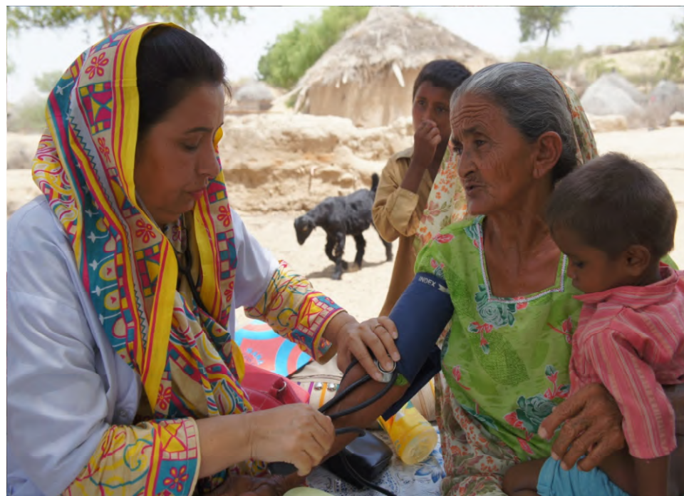
Outreach visit of Health Team

170,955 people are engaged in vaccination, capacity building events and awareness raising activities