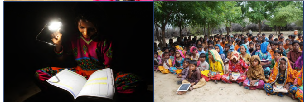
Increased Girls' enrolment in schools.