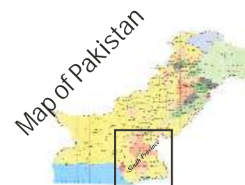
Geographical Area of PVDP Work